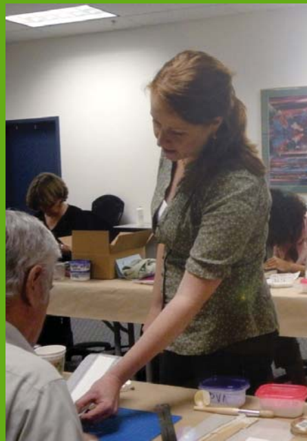
LYRASIS Fundamentals of Book Repair

“I appreciate this kind of training being available online. Even before all our budget cuts, it was very difficult for me to get away from my library to go out of town to training events. It's hard enough to be away from library duties for two hours. This way, LYRASIS' excellent training is available to all of us.”